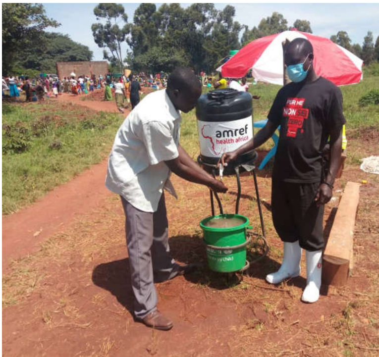
A VHT supervising hand washing at a boarder point in Arua.

Amref Health Africa is a member of the national Partners Taskforce Response to Covid-19 and uses this platform to inform the national strategy on Covid-19 response in Uganda.