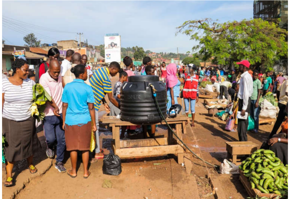
Communal handwashing facility in Kasubi market: Regular handwashing with water and soap is the first line of defense in tackling the COVID-19 pandemic.

"We also used the radio talk show to call upon Water User Committee members to ensure the cleanliness of their water sources and also adhere to the social distancing recommendation of at least one meter while collecting water," said Rose Mwambazi from CIDI.