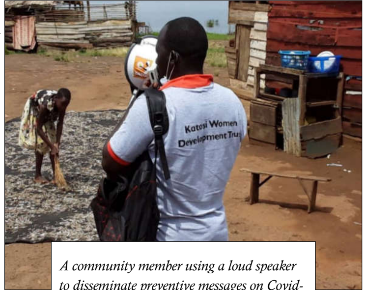
A community member using a loud speaker to disseminate preventive messages on Covid-19.