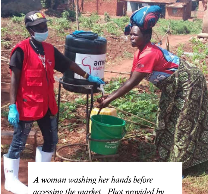
A woman washing her hands before accessing the market.

Amref Health Africa provided connection to safe water Atiak Health Center, a selected isolation facility for Covid-19 patients. A total of other eight (08) health facilities in Amuru district were supported by Amref Health Africa with safe water connection to facilitate hand washing with soap. Additionally, Amref Health Africa also provides actual supplies to these health facilities including soap and disinfectants.