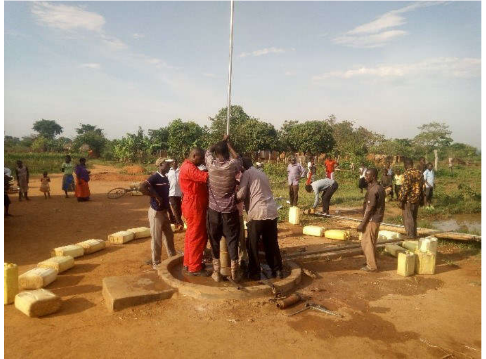
Hand Pump Mechanics repair a non-functional borehole in Buyende District

Busoga trust will repair twenty (20) non-functional boreholes in