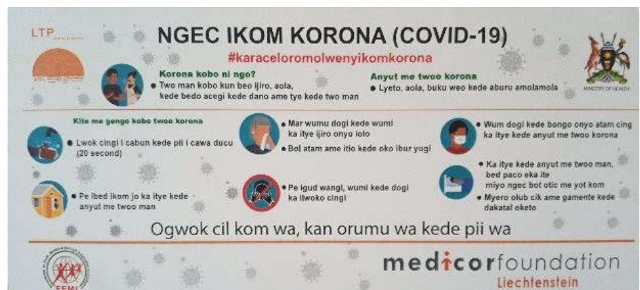
A picture of the sticker that was produced and disseminated with Covid-19 preventive messages.

As a member of the district taskforce, LTP was permitted to continue to work in Oyam but with Covid-19 information dissemination and to