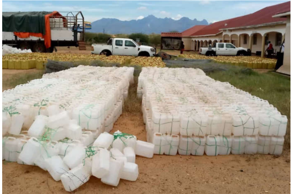
Truck delivers 5 litre handwashing facility, 20 litre jerry cans for safe water storage and soap to Amudat district taskforce support community practice handwashing during Covid-19 period .

Access to water: During the current Covid-19 crisis, water access in communities is key to ensure communities practice proper handwashing practice. In Moroto and Amudat some communities are indeed water stressed and Save the children has conducted assessment of 05 boreholes in Amudat and 05 boreholes in Moroto earmarked for