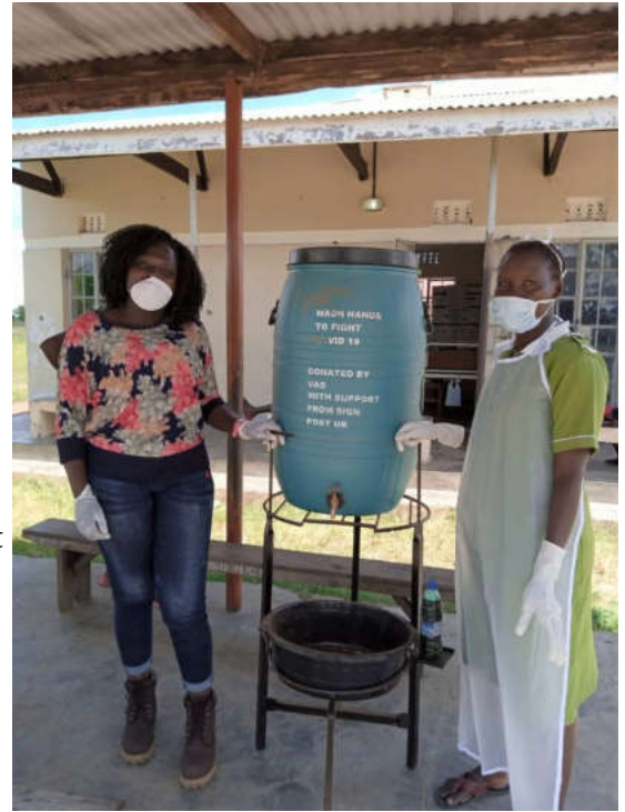
HWF installed at Amaseniko health center in Kapelebyong district.

In conclusion, we can firmly say that the project was to a larger extent successfully executed.