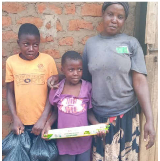
A family that received the food and soap items .

He said Kyempapu has a target of reaching 500 households with food and soap items during this lock-down.