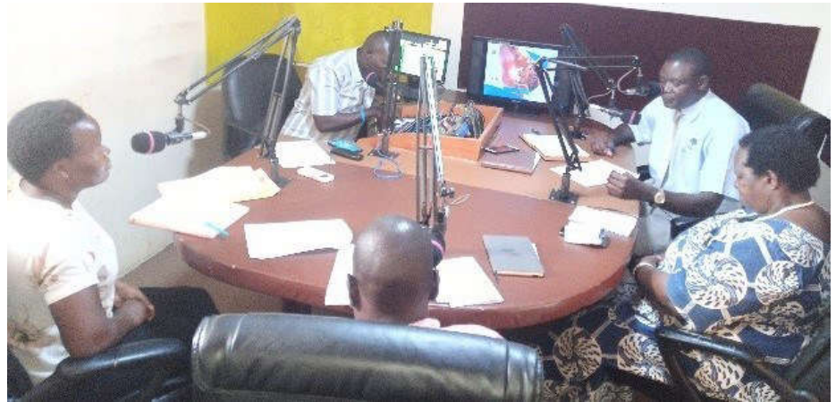
LTP representatives and district officials during radio talk-shows on Covid-19 prevention

LTP conducted radio talk shows with Kole district leaders and focused on what Covid-19 is, how it is spread, bad practices by the communities that can accelerate the spread of Covid-19, protective measures against Covid-19, and called on the community members to abide by the directives shared by Ministry of Health and the President of Uganda.