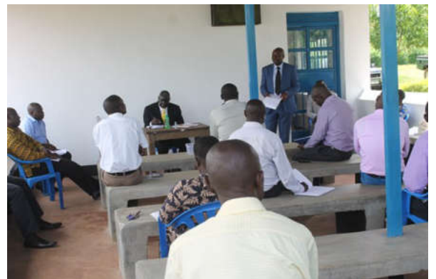
Busoga Trust staff attend Buyende district Covid-19 taskforce meeting

“Rusted Cylinders, GI pipes and rods were removed and replaced with new stainless parts that are more durable and resistant to hard water, which is common in this area. Most of these wells had been dis-functional for over two years due to high maintenance costs and