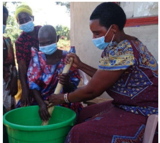
Women learning to make soap.

though farming has continued under the lockdown, fishing and fishing related activities were suspended. Fisher communities depend on fish for income and food, with fishing suspended hunger is widespread, many women are requesting KWDT to intervene with food relief.